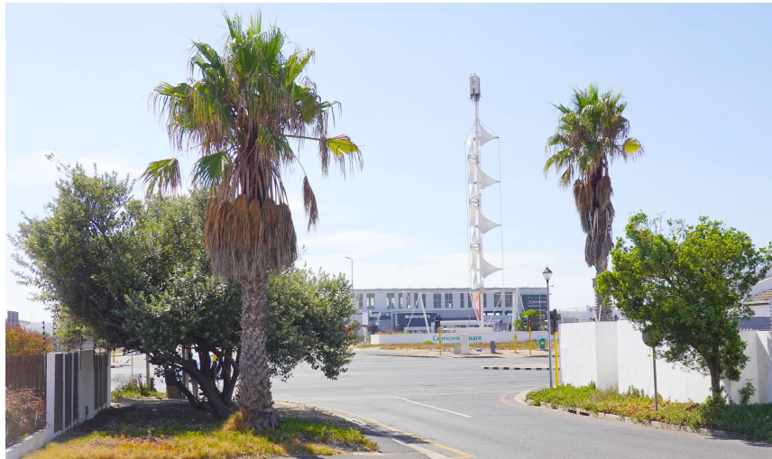
The Park Island Way entrance prior to pruning.

NOTE: We all live here so any comment and suggestions on beautifying our speck in paradise will be most welcome.