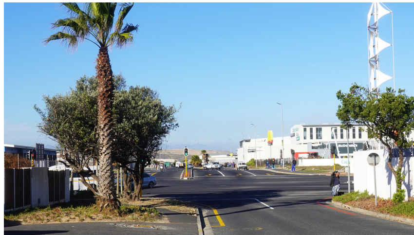
The Park Island Way entrance after to pruning.