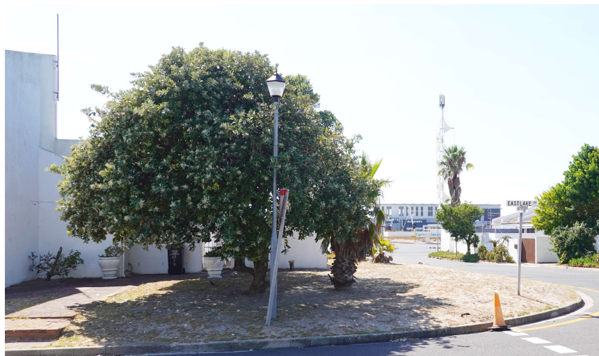
The Park Island Way – East Lake Drive corner prior to pruning.