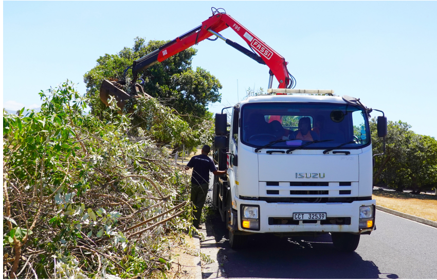
The pruning of the trees.