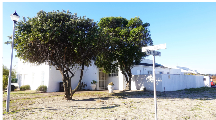
The Park Island Way – East Lake Drive corner after to pruning.